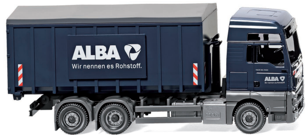
0672 04 Swap body (Meiller/MAN TGX Euro 6)