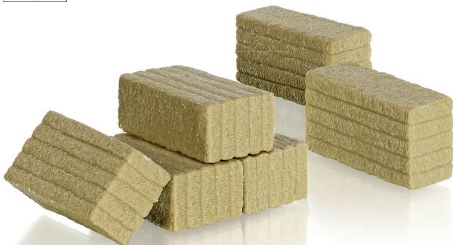
0773 94 Square bales, 6 items - 66 x 35 x 25 mm

T heir form also guarantees one of the main advantages: With optimum storage and stacking ability, square bales are becoming more widely accepted in farming. More farmers use simpler fork handling for bales that are very dry and pressed so they are compact. At WIKING the big baler LSB 1290 iD is waiting to pack the baler with square bales. Square bales that are now easily available make it easier to simulate harvest scenes.