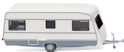
0092 03 Caravan (Dethleffs 530)