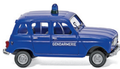
0224 04 Gendarmerie - Renault R4