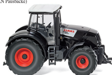
0363 02 Claas Axion 850

Traditional topics of WIKING become a valuable part of the model upgrading in August. The Swedish forwarding agency ASG once preferred the Volvo N 10 steel platform truck – WIKING now miniaturizes it in the colours of ASG. The favoured MAN “Pausbacke” completes the range of trucks in the colours of the well-known forwarder “Emons”. Following the fleet of the building company “Bölling” WIKING miniaturizes the “Demag” mobile crane for the historical