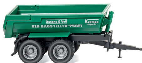
0388 14 Krampe Halfpipe Dumper