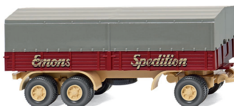
0416 03 Platform truck and trailer (MAN Pausbacke)