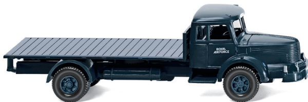
0480 04 Platform flatbed truck (Krupp Titan)