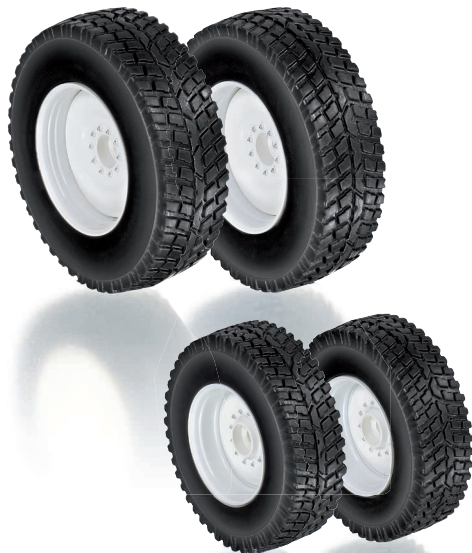
0773 96 Wheel set: Winter wheels for Valtra Baureihe T4

The Valtra T4 can be fitted with winter tyres and makes an outstanding model. This corresponds to the equipment fitted on municipal farms that are not