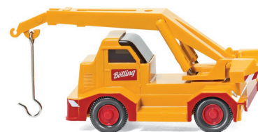
0680 02 Mobile crane (Demag)