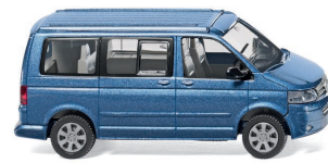
0273 40 VW T5 GP California