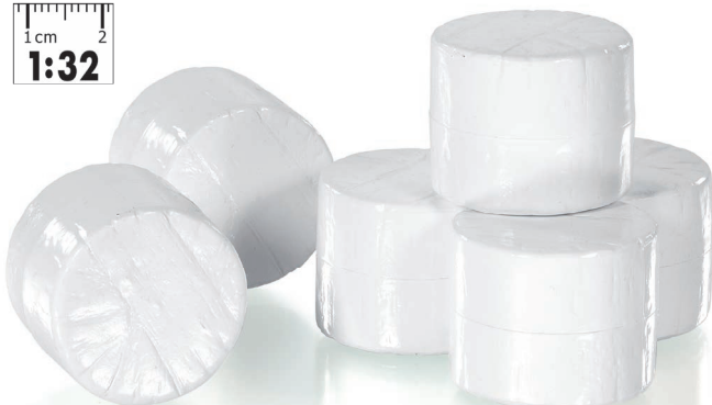
0773 92 Round bales in bale silage film, 6 items - Ø 35 mm

T hey're part of everyday life on the farm: Bale silage is increasingly popular and already has a firm place in milk production. Pressed bales packed in film are everywhere today and give high quality fermented fodder without too much waste. Silage bales can be used in dairy food fodder with great success. Harvested bales are compacted and stored in several layers of plastic film. A tractor with square baler unit is essential for lifting and storing bales in plastic film.