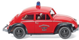
0861 37 Fire engine - VW Beetle 1200