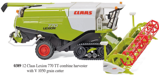
0389 12 Claas Lexion 770 TT combine harvester with V 1050 grain cutter