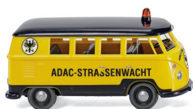
0797 19 ADAC - VW T1 bus