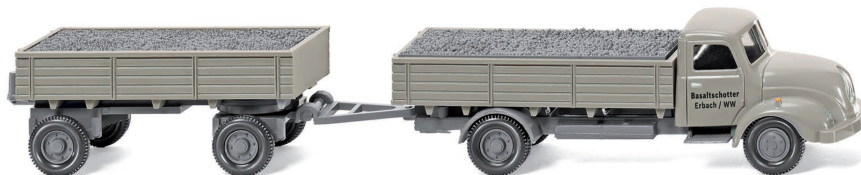
0420 01 Platform flatbed trailer (Magirus S 3500)

W IKING starts the harvest season with the brand new Claas Lexion 770 TT with the V 1050 grain cutter – an imposing machine with high precision standard. The functional Terra Trac has been miniaturized for the first time in the agricultural section - it stands for cross-country mobility of the latest harvester generation. The VW T5 GP California and the MAN TGX Euro 6 with the Meiller swap body in the colours of