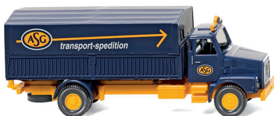
0462 01 Steel platform truck (Volvo N 10)