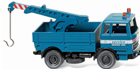
0634 03 Breakdown truck (MB 1620)