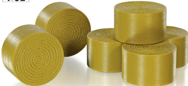
0773 93 Round bales, 6 items - Ø 54 mm

R ound bales are a common feature over the decades for Europe's fields. They are easily transportable to the front loader with no manual effort. Especially on farms, a compact tractor with lifting and simple bale unit is easy to move for round bales. Bales weighing approx. 130 kilograms are easy to move short distances and can also be rolled as required. Round bales to 1:32 scale give more realistic impressions of harvest trailers.