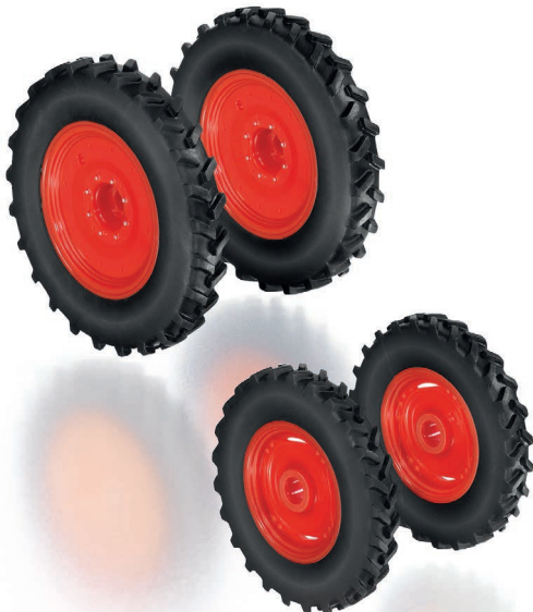
0773 95 Wheel set: Row crop wheels for Claas Arion 400

The Claas Arion 400 series is the perfect tyre type. Tyres provided by WIKING are obviously narrower and make the tractor more suitable for work in plant protection and special cultures. Thanks to the tyres the agricultural machine