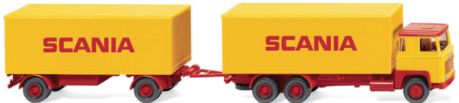
0457 02 Box trailer road train (Scania 111)