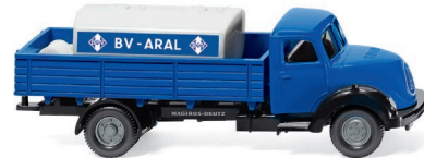
0438 03 Flatbed lorry with vehicle-mountable tank (Magirus Sirius)