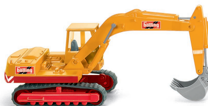
0660 08 Crawler excavator (O&K)