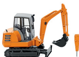
0658 06 Mini excavator HR 18