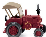
0880 09 Lanz Bulldog with roof