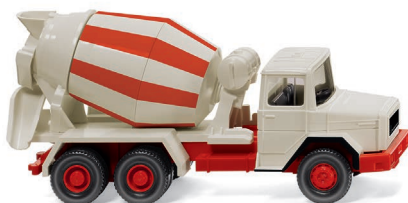
0682 05 Concrete mixer (Magirus Deutz)