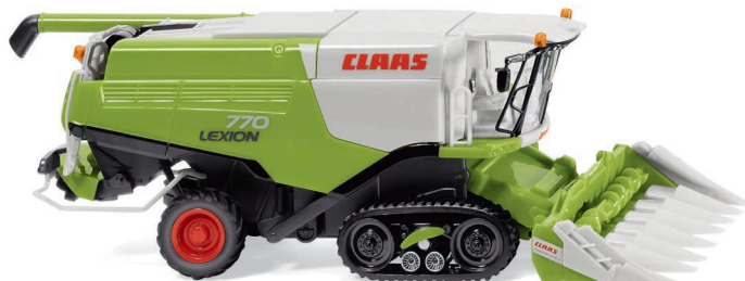
0389 13 Claas Lexion 770 TT combine harvester with Conspeed corn header

WIKING presents the absolute latest with the latest MAN TGL Euro 6 generation as an ADAC towing vehicle and a fire brigade engine with Rosenbauer AT superstructure. These are accompanied by the Avantgarde version of the Mercedes-Benz E-Class. With the Tempo Matador as a low-side flatbed and the Magirus Sirius in Aral livery, WIKING