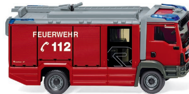
0612 46 Fire brigade – Rosenbauer AT LF (MAN TGM Euro 6)