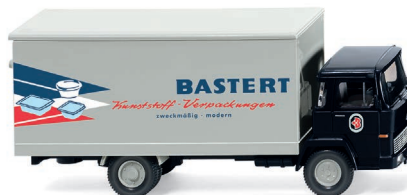
0425 01 Box truck (Magirus 100 D7)