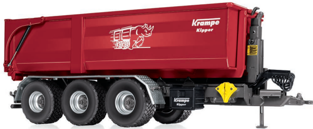
0778 26 Krampe hook lift THL 30 L roll-off container with Big Body 750