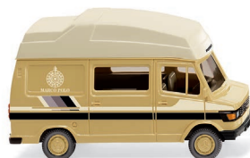
0267 01 Camper van (MB 207 D)