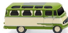
0260 03 Panorama bus (MB O 319)