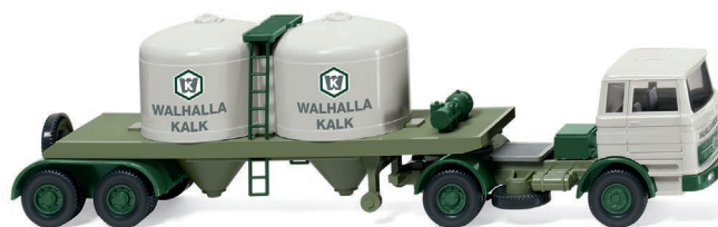
0534 03 Chemical semi-trailer (MB 1620)

W IKING underlines its leading claim to classics from new and old moulds, with the model upgrades succeeding in miniaturising the entire spectrum from real to modern classics. The Lanz Bulldog with roof therefore appears with the colour updated, and twinned as required with the long-serving Allgaier single-axle trailer. The Mercedes-Benz 300 evokes the 1950s in its stylish colour scheme. Wonderfully contemporary designed are the curtains of the Panorama bus of the Mercedes-Benz O 319, which represents the years of Germany's economic miracle. Then comes the Porsche