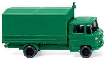
0864 42 Police – flatbed lorry (MB L 408)