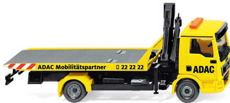
0636 07 ADAC – towing vehicle (MAN TGL Euro 6)