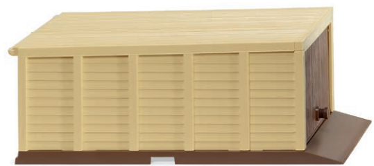
1140 03 Self-build garage (3S) True-to-the-original prefabricated model of the sixties since 1967