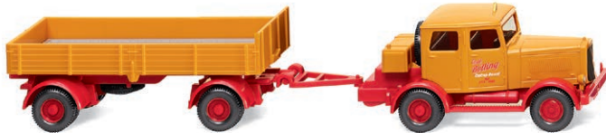
0850 48 Hanomag with flatbed trailer Favoured collector cycle modelled after Ruhr region originals 1946-52