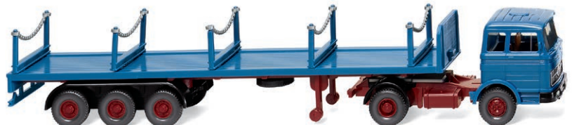
0554 06 Stanchion trailer truck (MB) Long-goods hauling in Mercedes blue 1968-71