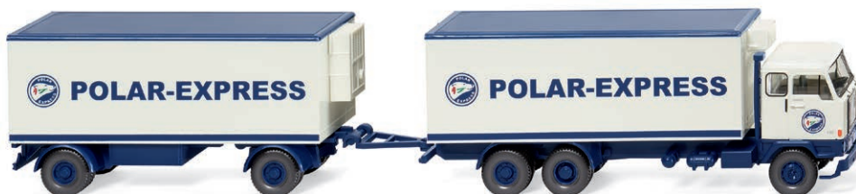
0457 04 Refrigerated road train (Volvo F88) Finland - Italy 2 times a week 1965-70