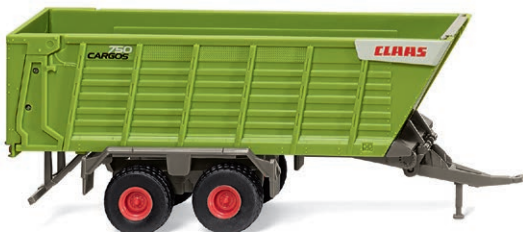
0381 98 Claas Cargos forage trailer Version as a chaff transport wagon with road tyres