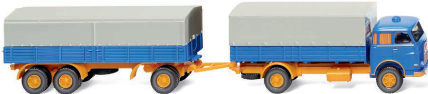
0416 04 Platform trailer truck (MAN Pausbacke) Classic cab-over-engine combination 1960-67