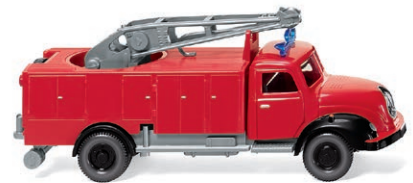
0623 04 Fire brigade rescue vehicle (Magirus) Round hood designed to provide technical assistance 1956-61