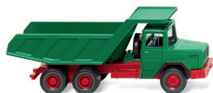
0990 99 Set „Magirus Baubullen“ Trio of the last square hood generation from Ulm 1970-74