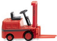
1171 02 Forklift truck (Clark) Pioneer in inventory turnover 1952-56