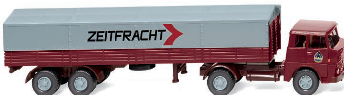
0514 07 Flatbed tractor-trailer (Henschel) Loyal Henschel customer of the 1960s 1961-65