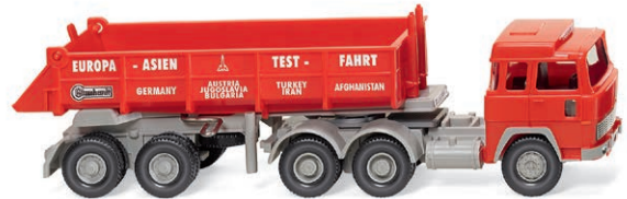
0677 08 Rear tipper semi-truck (Magirus 235 D) 7,018 kilometre test drive from Munich to Kabul 1963-71