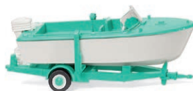
0095 03 Trailer-mounted motor boat The upscale way to spend your days off 1961-65