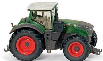
0361 64 Fendt 1050 Vario The latest version of the Allgäu-made tractor