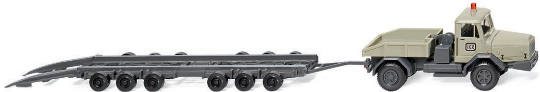
0493 01 Wagon-carrying road trailer Culemeyer (Faun) Imposing bonnet truck of the federal railway 1965-77